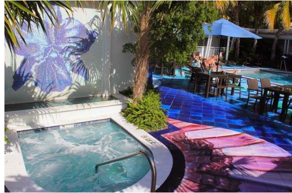
5500 EX Art – Pool Deck, Spa Area & Flower